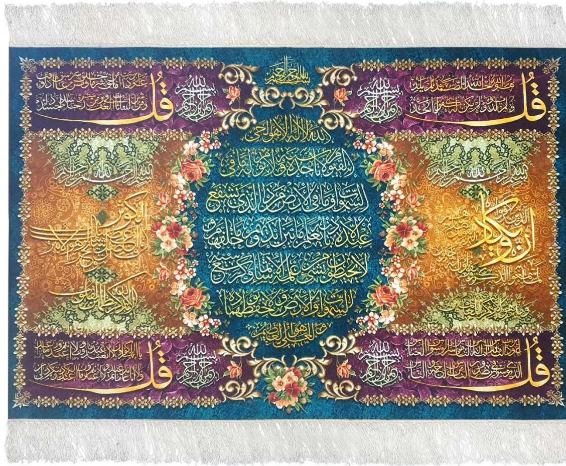
Artwork Code: BT-01-012 Collection: Qur'anic Script & Calligraphy Technique & Materials: Handwoven by master artisans exclusively for Bayt Al-Tiraz | Silk Foundation | Wool & Silk Pile | Dimensions: 100 × 150 cm (Approx.) Knot Density: Fine (50-60 Raj)